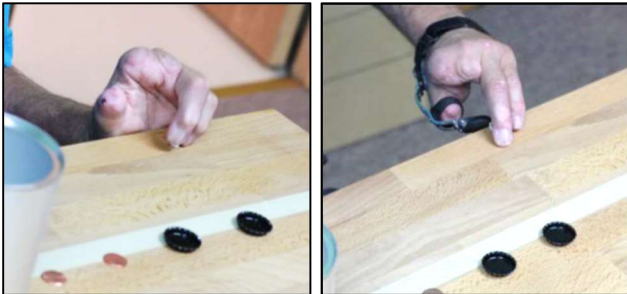
Figure 2: Lifting paperclip during JHFT